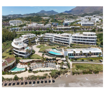
Ref.-ID: R5079970 Estepona