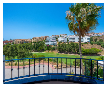
Riviera del Sol Ref.-ID: R5074723