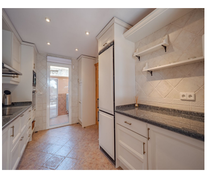
Riviera del Sol Ref.-ID: R5074102

Community: 3,300 EUR / year IBI: 674 EUR / year