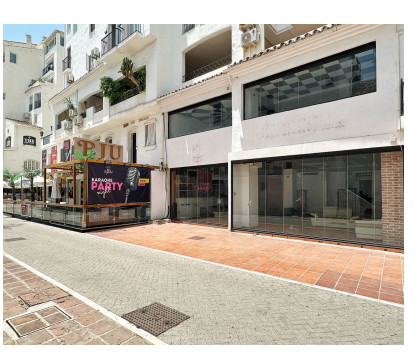
Ref.-ID: R5073103 Puerto Banús Commercial