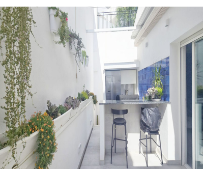
Ref.-ID: R5064982 Benalmadena Pueblo