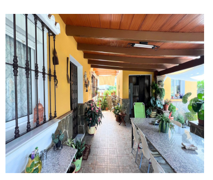
Ref.-ID: R5064853 Coín