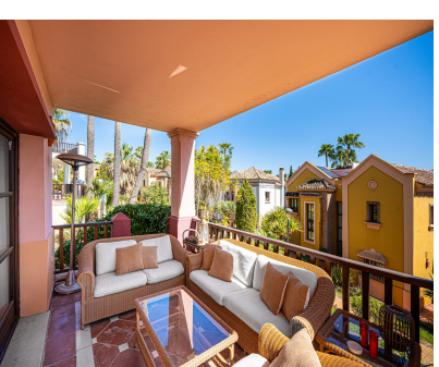
The Golden Mile Ref.-ID: R5064244