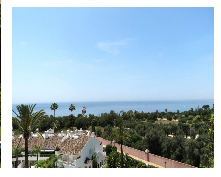
Ref.-ID: R5063290 Río Real Apartment