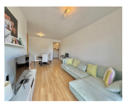
Ref.-ID: R5062291 Fuengirola Apartment