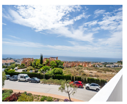
Calanova Golf Ref.-ID: R5061859