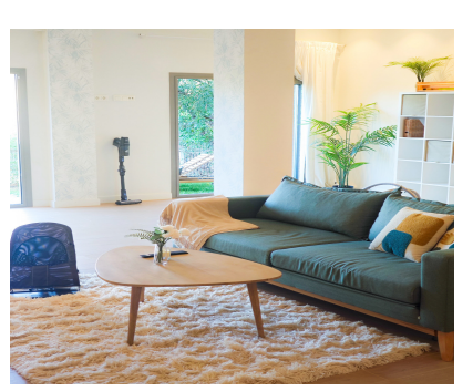
Ref.-ID: R5061334 Mijas