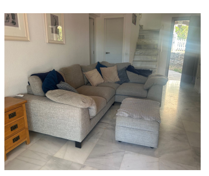
Ref.-ID: R5059090 Calahonda House