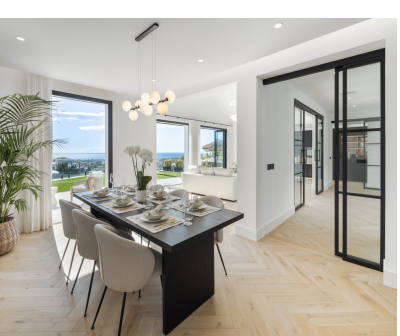
House Ref.-ID: R5057956 La Quinta