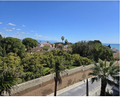
Torremolinos Apartment Ref.-ID: R5057665