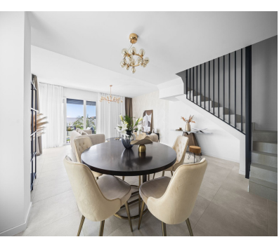
Ref.-ID: R5055667 La Cala de Mijas