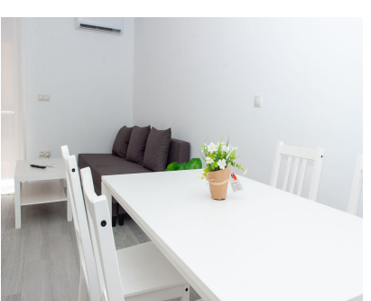
Ref.-ID: R5054875 Fuengirola Apartment