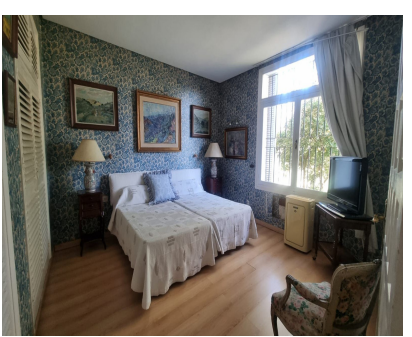
Ref.-ID: R5051320 Marbella House