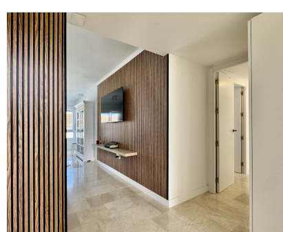
Ref.-ID: R5046604 Fuengirola Apartment