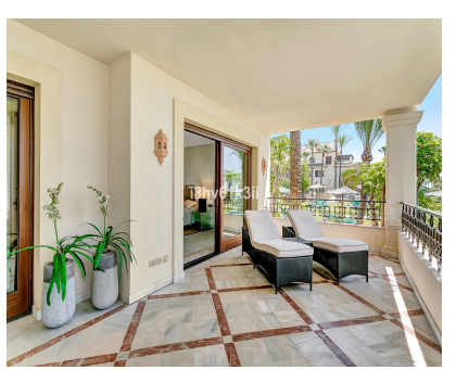
Ref.-ID: R5044456 Marbella Apartment