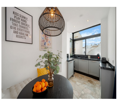
Ref.-ID: R5042299 Fuengirola Apartment