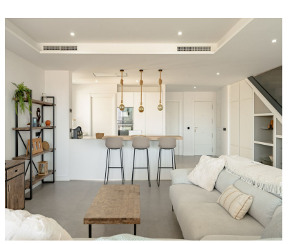
Ref.-ID: R5034265 Estepona