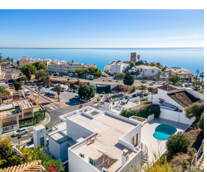
Ref.-ID: R5032000 Benalmadena