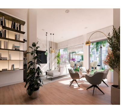
Ref.-ID: R5026981 Estepona Apartment