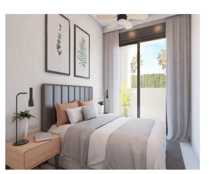
Ref.-ID: R5024320 Benalmadena Costa Apartment