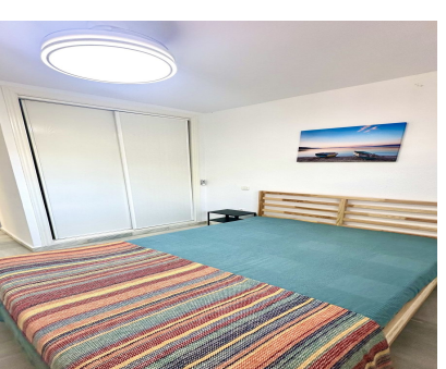
Riviera del Sol