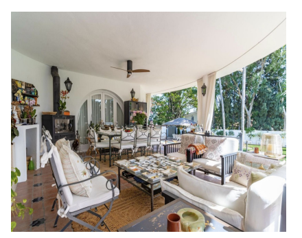
The Golden Mile