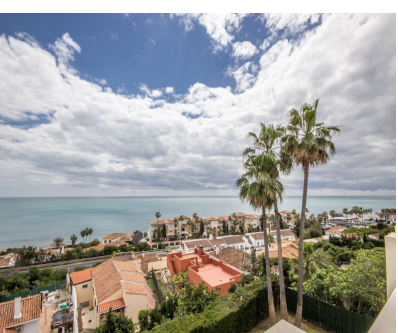
Ref.-ID: R5015998 Estepona House

IBI: 838 EUR / year Rubbish: 136 EUR / year