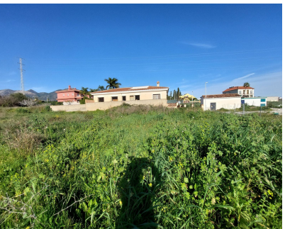
Ref.-ID: R5015131 Mijas Plot