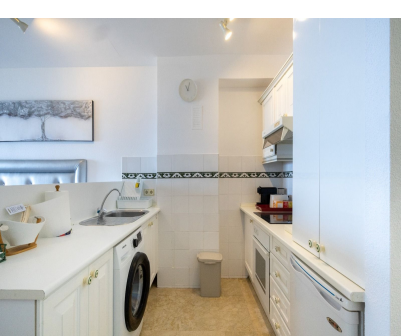
Ref.-ID: R5015095 Estepona Apartment