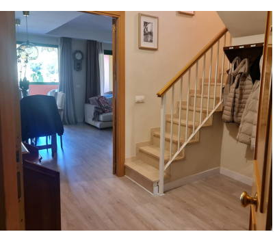
Ref.-ID: R5005999 Fuengirola Apartment