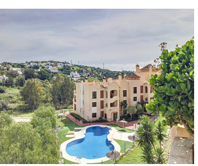
Ref.-ID: R4994188 Estepona Apartment