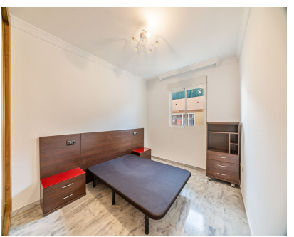
Mijas Costa Apartment Ref.-ID: R4992418