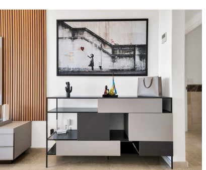
Ref.-ID: R4991629 Elviria Apartment