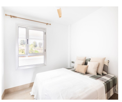
Ref.-ID: R4991035 La Cala Golf Apartment