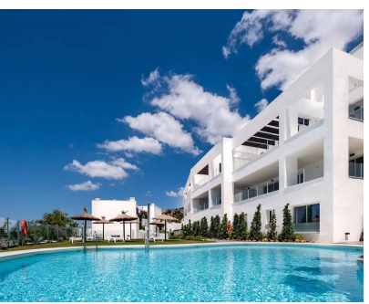
Ref.-ID: R4990792 Marbella Apartment