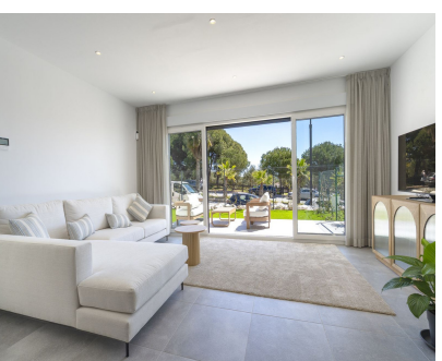
Ref.-ID: R4990474 La Cala de Mijas

Community: 2,484 EUR / year IBI: 950 EUR / year