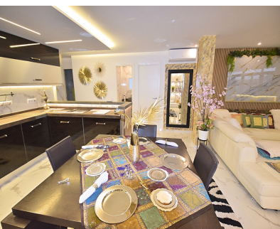
Ref.-ID: R4974694 Marbella Apartment