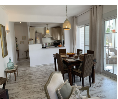
Ref.-ID: R4974283 Estepona