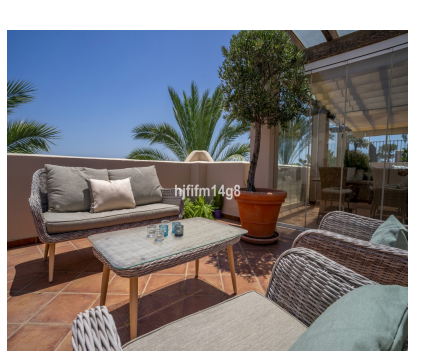
Ref.-ID: R4970107 Estepona