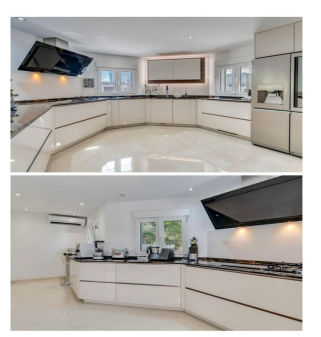
Ref.-ID: R4964827 Marbesa House