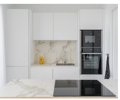
Ref.-ID: R4954591 Estepona Apartment