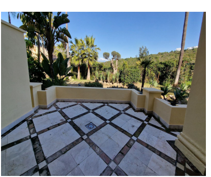
Estepona Ref.-ID: R4951204