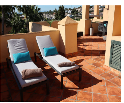
Ref.-ID: R4944229 Atalaya Apartment