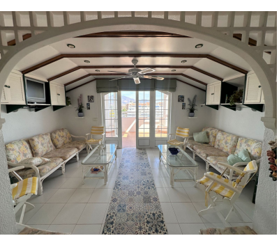
Ref.-ID: R4931995 Fuengirola Apartment