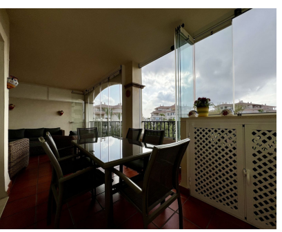
Ref.-ID: R4921738 La Cala Hills Apartment