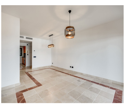
Atalaya Ref.-ID: R4917337