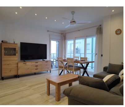
Ref.-ID: R4913335 Fuengirola Apartment