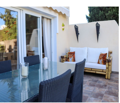
Ref.-ID: R4909474 Calahonda