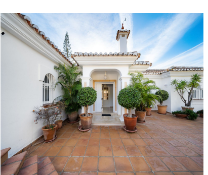
Ref.-ID: R4907563 El Chaparral