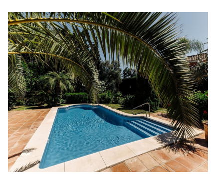
Ref.-ID: R4907305 Bahía de Marbella House

Community: 1,560 EUR / year IBI: 3,600 EUR / year